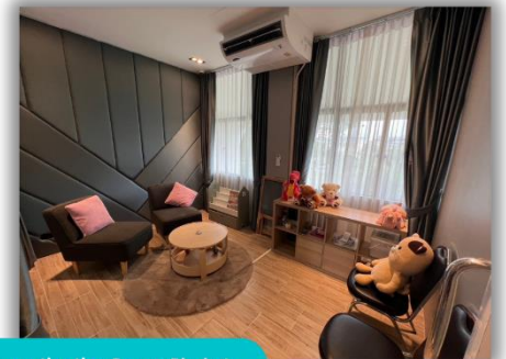
Child Investigation Room, Phuket